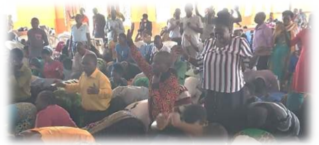
Pastors Crying Out for Their City

The work of the Holy Spirit could not be denied in Bukoba, Tanzania, as we saw pastors and counsellors working side by side in unity there. It is not unusual for the For His Glory team to have to work very hard to promote unity throughout the local church. That did not seem to be the case in Bukoba.