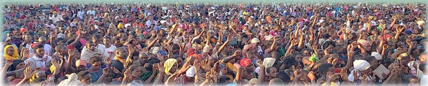
People Answering the Call to Christ at the Festival

Multiplication is rolling out and more T4T groups are being formed, while others are maturing. Praise God for the great work He has done before our very eyes in these extremely difficult times! Broken families are being restored and lives are being transformed!