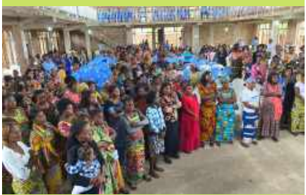
Women's Conference in Kisangani