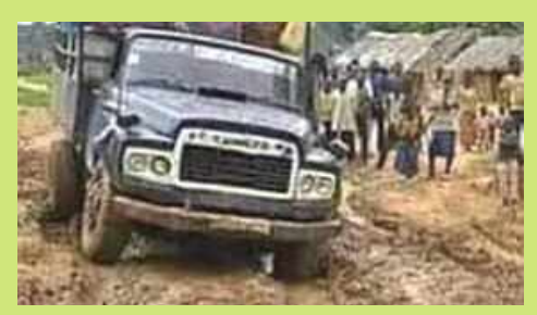
Bad Road Conditions to Kisangani

Through this divine direction, we had the right sound system transported to Kisangani, both in time and in good shape, and we had the biggest festival in terms of new decisions for Christ and overall turnout ever in For His Glory's history.