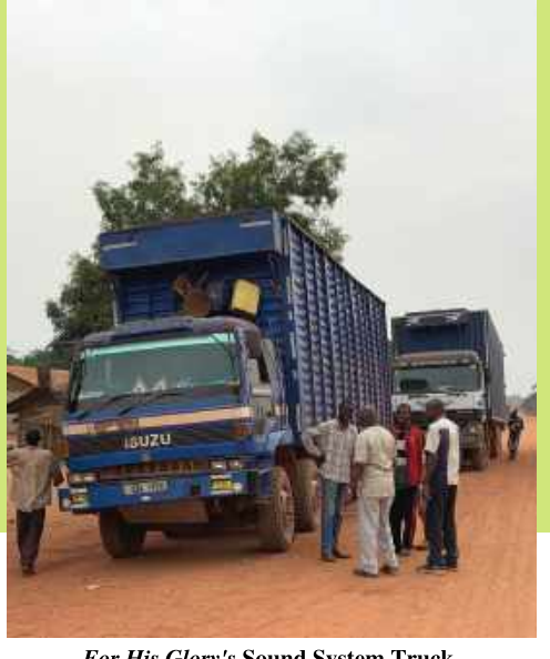
For His Glory's Sound System Truck Arrives Safely in Kisangani