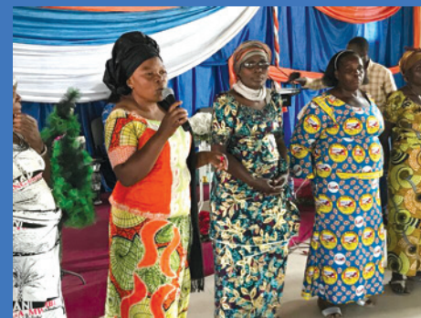
Goma Women Sharing Testimonies