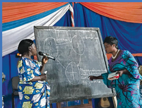
Goma Women Teaching T4T

"Sharing testimonies about Jesus goes a long way in offering hope to others!"