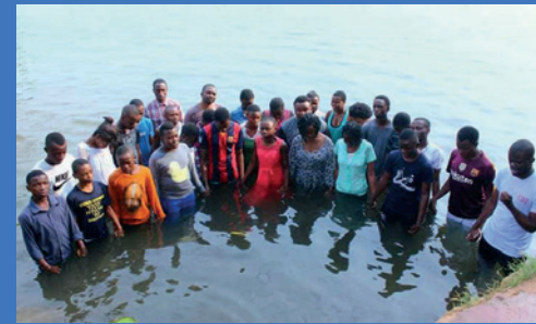
Group Baptism in Congo, Sep 3rd, Resulted from T4T