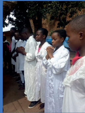
Young People Praying Before Baptism