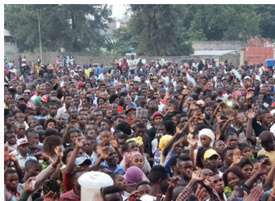
Men, Women & Children Lifting Hands to the Lord at Festival