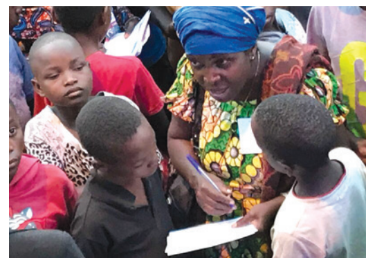
Children Came Forward to the Call of Salvation