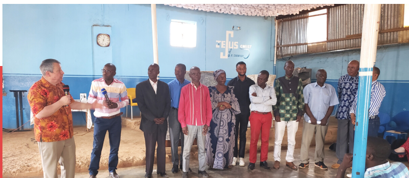
For His Glory Team Members Leading T4T Training and Praying with Lubumbashi Church Leaders