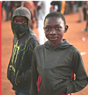
People of Lubumbashi Gathering to Attend the Festival