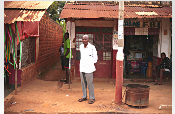
On the Streets of Lubumbashi Near the Mission Field