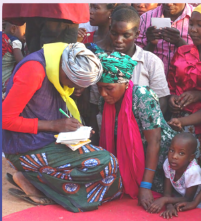
New Believers Giving Their Information to a Counselor at the Festival

Seeing the joy on the faces of the people and experiencing the celebration of worshipping Jesus at the end of the festival was amazing! Faces beaming, arms waving, sixty thousand people rejoiced in what Christ had done – saving us forever and making us children of the Living God! Hallelujah!