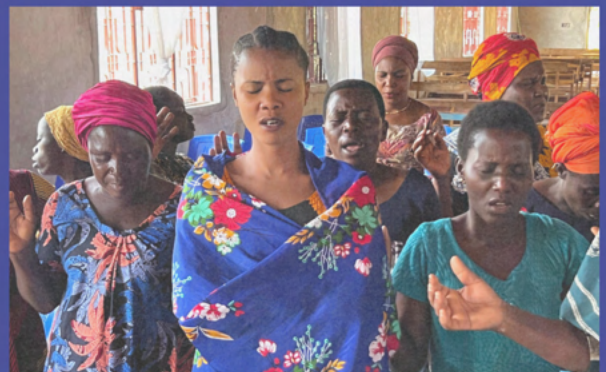
Women Responding in Prayer at the Women's T4T Conference