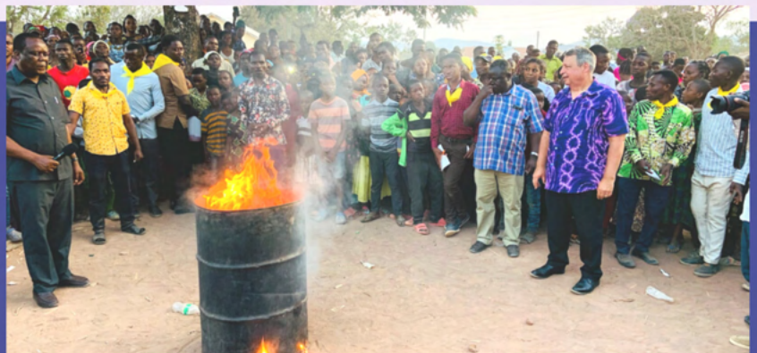
Burning Witchcraft Items at the Festival