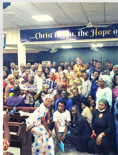
T4T Training with Key Church Leaders in Abuja